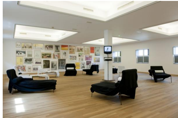
The Franz West room in Augenspiel . Location of the Poetry Lounge

One of the locations of A forbidden love in a play of lines ..